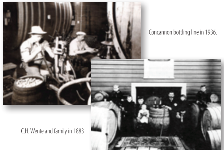
Concannon bottling line in 1936.

Attracted to the rich winemaking tradition, unique geography, soils and climate, new winemakers and vineyardists are working alongside fifth generation winegrowers to create a Livermore Valley wine renaissance. The region now has more than 50 wineries, varying from limited release, 100-case labors of love to 400,000-case industry leaders. The future of Livermore Valley is bright—as promising as it was when the first growers settled the region in the early days of California's winemaking history.